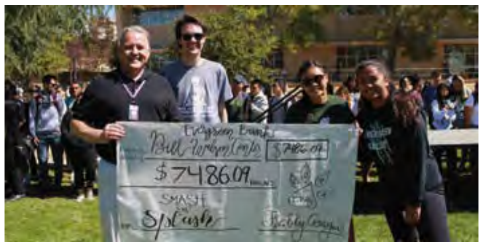
Sereno Group realtors team with BWC