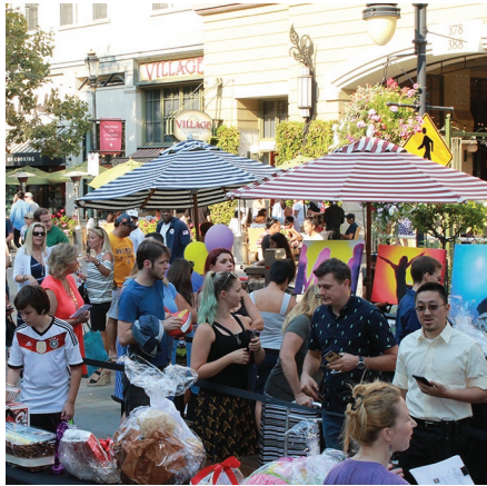
Santana Row BWC Wine Stroll