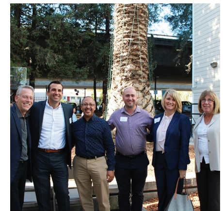
BWC Drop-In Center Open House