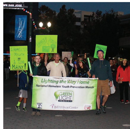
Green Light Walk