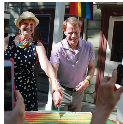
Drop-In Center LGBTQ Open House