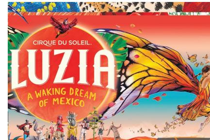
BWC Night at Cirque du Soleil

Gifts of all levels are critical to the success of our work and we thank all our donors for their generous support. Due to space limitations, this list includes donors who contributed or pledged at the level of $1,000 or more between July 1, 2016 and June 30, 2017. Every attempt has been made to assure the accuracy of this list and we apologize for any inadvertent errors or omissions.