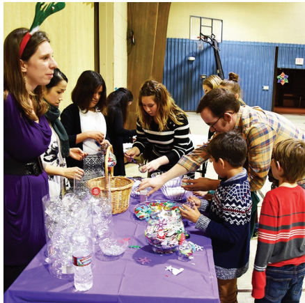
BWC Foster Family Holiday Party