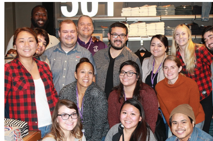
49ers Quinton Dial Foundation