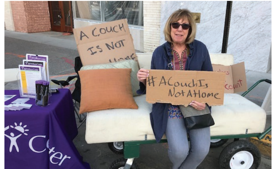
Campbell Farmers Market

A team of Amazon employees make improvements at BWC's Maternity Transitional Living site.