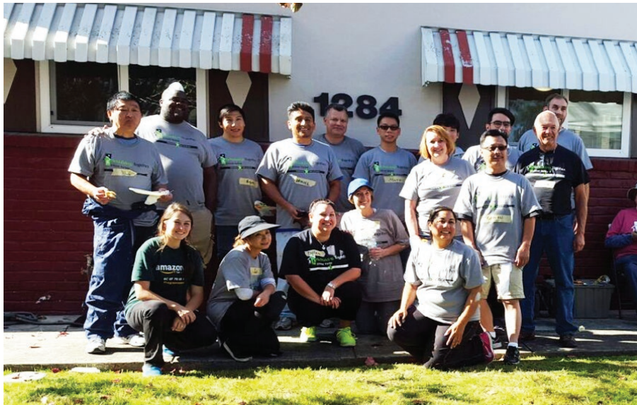
BWC Volunteers - Building Together

Gifts of all levels are critical to the success of our work and we thank all our donors for their generous support. Due to space limitations, this list includes donors who contributed at the level of $1,000 or more between July 1, 2017 and June 30, 2018. Every attempt has been made to assure the accuracy of this list and we apologize for any inadvertent errors or omissions. Contact Pilar Furlong at (408) 850-6132 or pfurlong@billwilsoncenter.org for any changes.