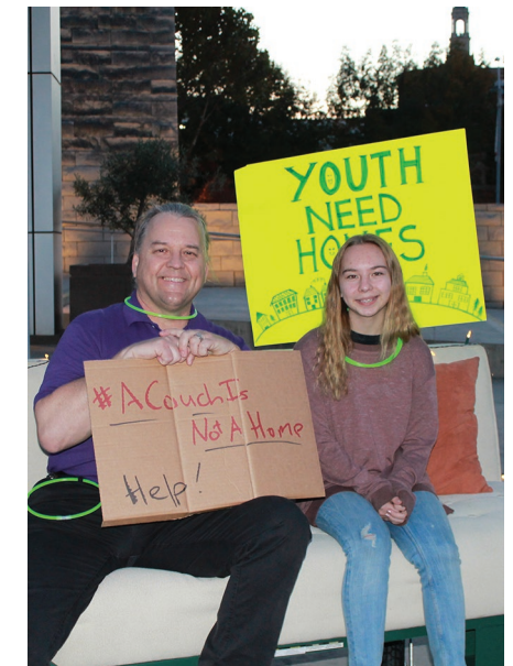
Green Light Rally & Walk The Reynolds family with Couches Don't Count .