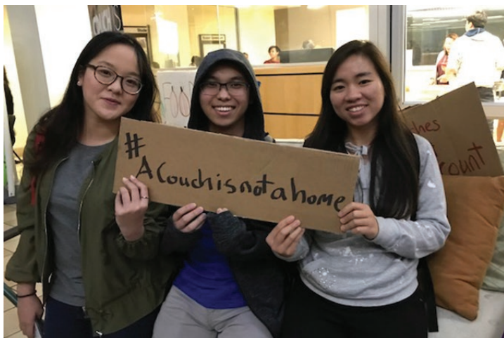
San Jose City College Poverty Summit #ACouchIsNotAHome receives support from students.